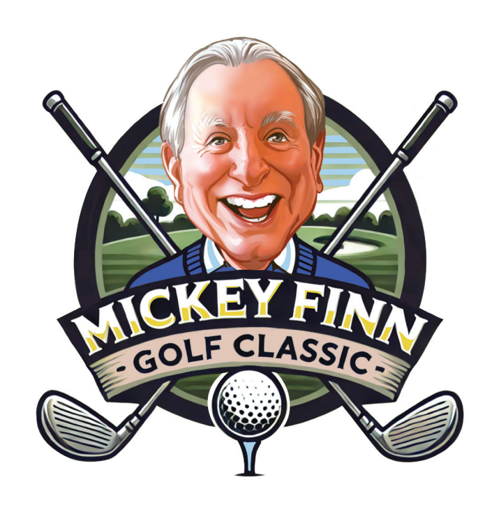
See details on page nine!