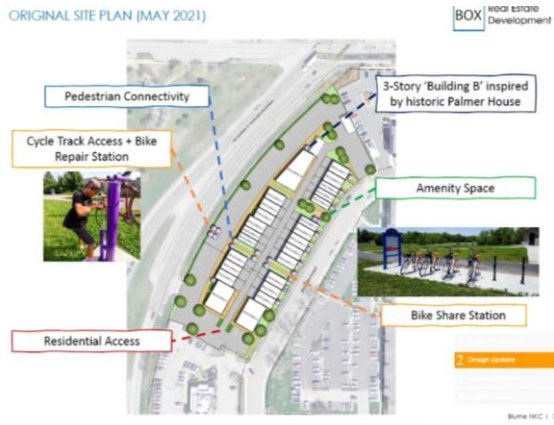
ORIGINAL SITE PLAN (MAY 2021)