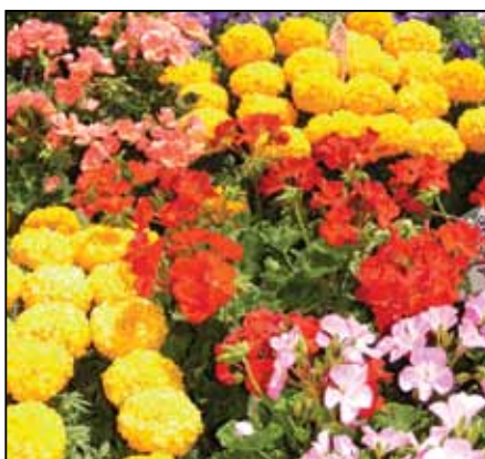
The North Kansas City Farmer's Market is open every Friday from May 6 through October 28 in Caboose Park.

Just as in the past few years, the North Kansas City Farmer's Market will be at Caboose Park on Friday mornings. The market season begins Friday, May 6 and will continue until October 28. The location is convenient for nearly everyone who lives, works, plays or eats in North Kansas City. Parking is available nearby. Shade trees and grass create a park-like setting. As a result of an online survey with 95 responses the overwhelming favorite day and time of day was Friday mornings. The market will stay open from 7 a.m. until after normal lunch times. First Watch has agreed to offer